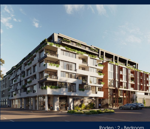
Roden: 2 - Bedroom