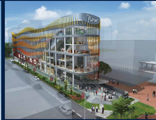
5th & 6th Storey