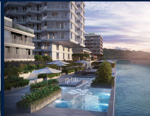
3 - Bedroom Villa