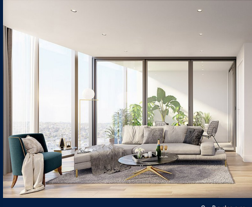
2 - Bedroom