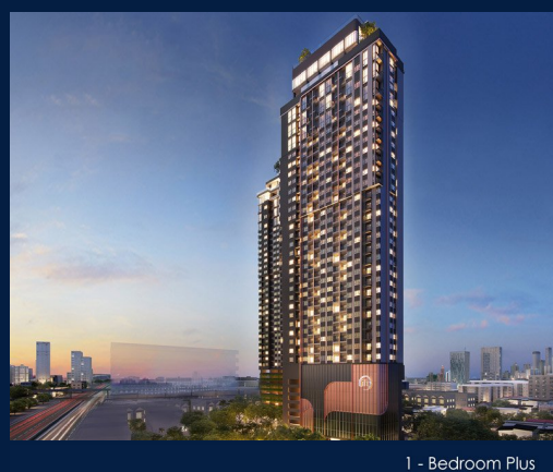
TYPE F1 - F4