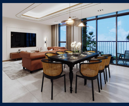
4 - Bedroom + Study