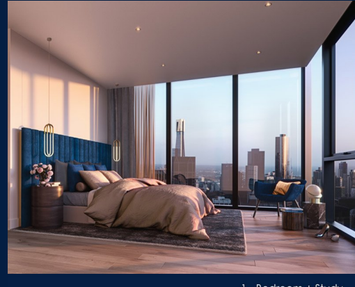
1 - Bedroom + Study