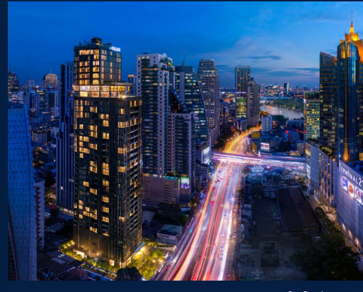
3 - Bedroom