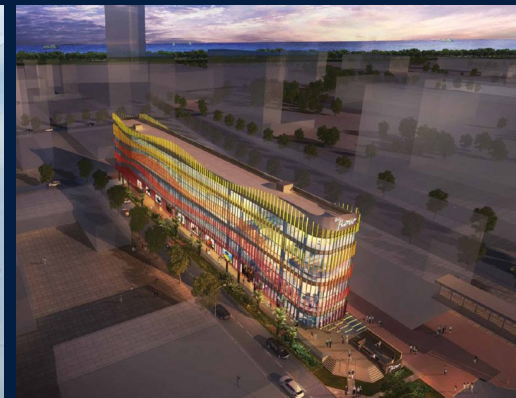
3rd & 4th Storey