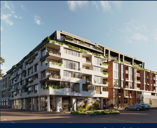
Roden: 2 - Bedroom