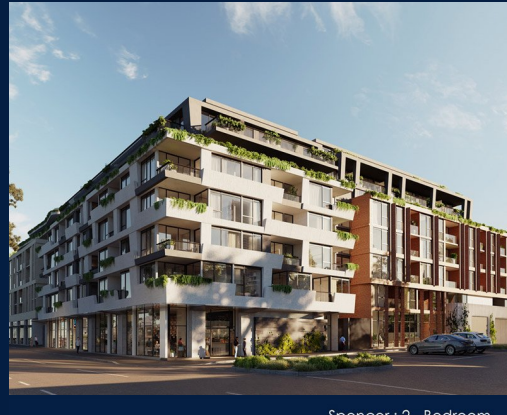
Spencer: 2 - Bedroom